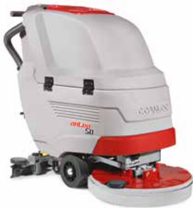
Antea 50 E/B/BT