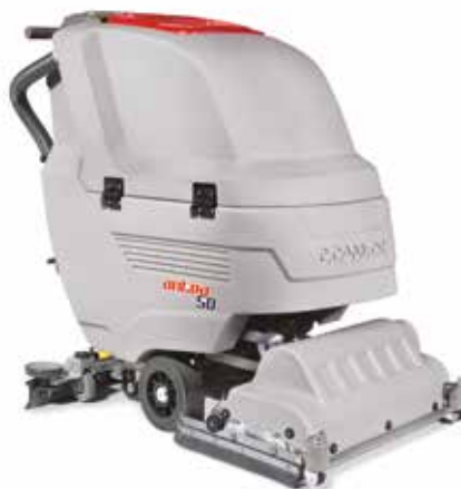
Antea 50 BTS