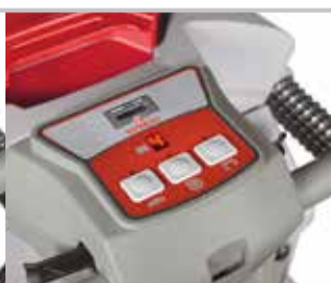
Control panel of B version