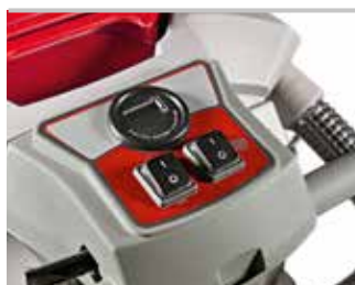
Control panel of E version