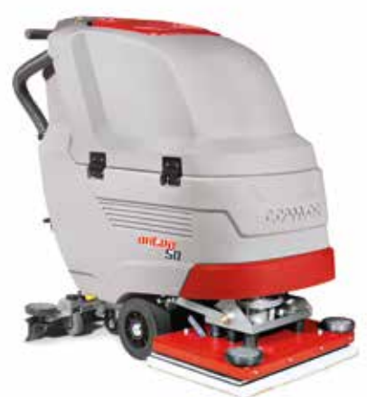
Antea 50 BTO Orbital