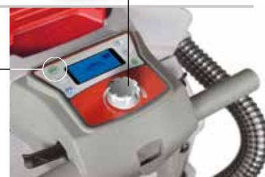
Control panel of traction versions