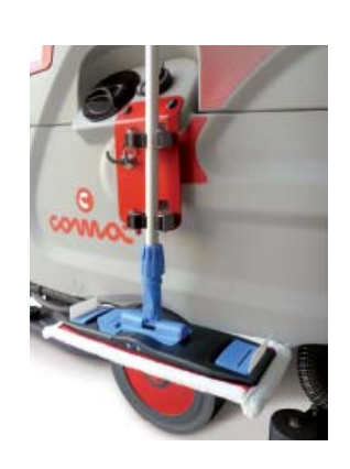
Innova 60/65/75/85 B - 70 S is available on request with a support for your manual cleaning kit, that allows to complete the cleaning operation