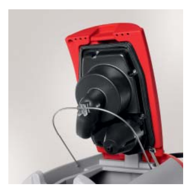
The vacuum head is silenced, guaranteeing a very low acoustic pressure level and allowing to perform in highly noise-sensitive environments such as nursing homes and hospitals, without disturbing the environment or the people who live in it