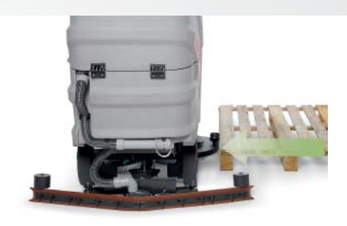
Automatic swing-in of the brush head when accidentally impacted (Innova 65/75/85 B)