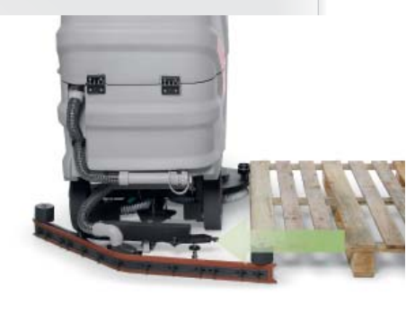
Automatic squeegee uncoupling when accidentally impacted