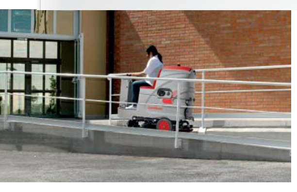
Low center of gravity for optimum stability. Capable of ramp gradients up to 18%